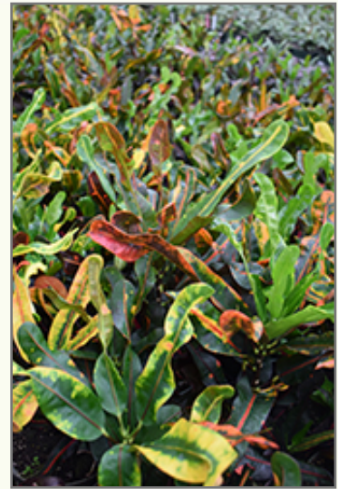
Mammy Croton in full

This is a dense herbaceous evergreen houseplant with an upright spreading habit of growth. Its wonderfully bold, coarse texture is quite ornamental and should be used to full effect. This plant should not require much pruning, except when necessary to keep it looking its best.