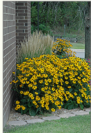
Goldsturm Black Eyed Susan in bloom