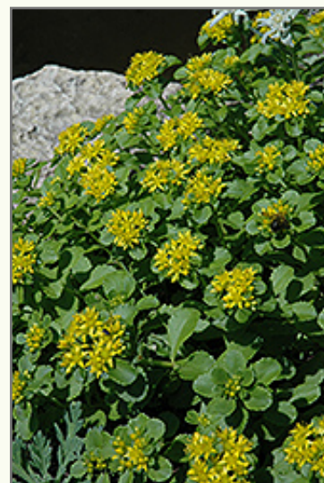
Kamtschaticum Sedum flowers