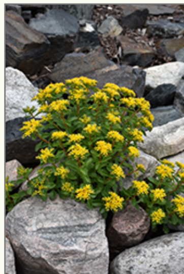
Kamtschaticum Sedum in bloom

Kamtschaticum Sedum is recommended for the following landscape applications;