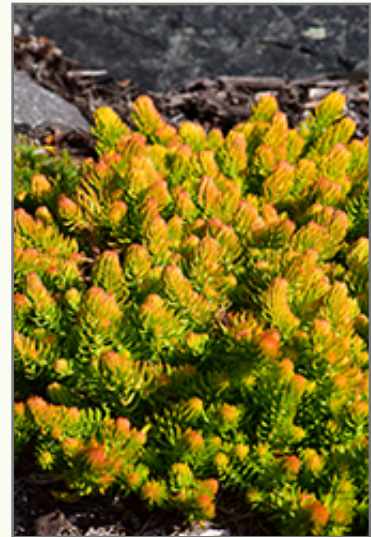
Angelina Sedum foliage