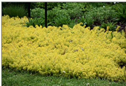
Angelina Sedum