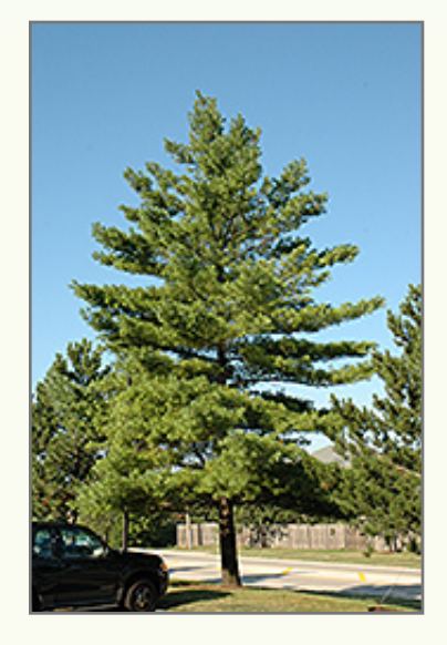
Eastern White Pine

A highly attractive shade tree, features silky smooth long needles which give a fuzzy appearance from a distance, tall wide habit of growth; can windburn in exposed locations, best grown in some shelter, but needs full sun; a beautiful specimen tree