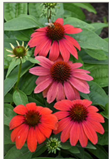
Artisan Red Ombre Coneflower flowers