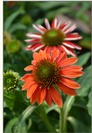
Artisan Red Ombre Coneflower flowers

This is a relatively low maintenance plant, and is best cleaned up in early spring before it resumes active growth for the season. It is a good choice for attracting butterflies to your yard, but is not particularly attractive to deer who tend to leave it alone in favor of tastier treats. It has no significant negative characteristics.