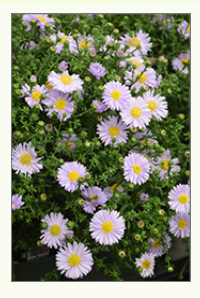
Kickin Lavender Aster flowers

Compact, with a full, bushy habit, featuring a profusion of lavender flowers from late summer to fall; prefers cool, moist soil; water the root zone instead of from the top to reduce fungal disease; great for containers or border fronts