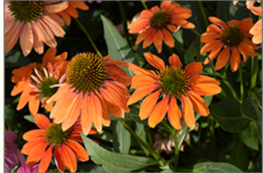
Artisan Soft Orange Coneflower flowers

This is a relatively low maintenance plant, and is best cleaned up in early spring before it resumes active growth for the season. It is a good choice for attracting bees and butterflies to your yard, but is not particularly attractive to deer who tend to leave it alone in favor of tastier treats. It has no significant negative characteristics.