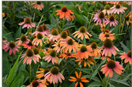
Artisan Soft Orange Coneflower flowers