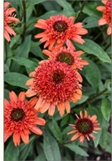
Moab Sunset Coneflower flowers