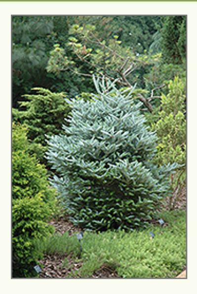
Horstmann's Silberlocke Korean Fir

Horstmann's Silberlocke Korean Fir is recommended for the following landscape applications;