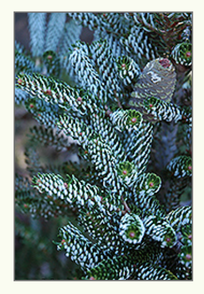
Horstmann's Silberlocke Korean Fir foliage