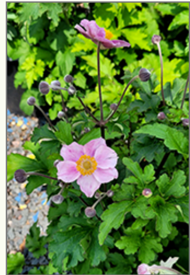
Pink Saucer Anemone flowers