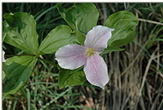
White Trillium flowers (faded)