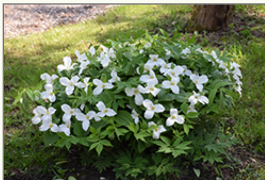
White Trillium in bloom