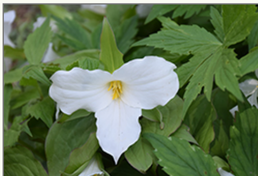
White Trillium flowers

This is a relatively low maintenance plant, and should not require much pruning, except when necessary, such as to remove dieback. It has no significant negative characteristics.