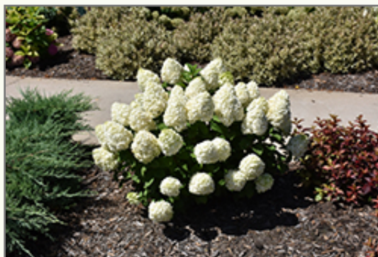
Little Lime Punch Hydrangea in bloom