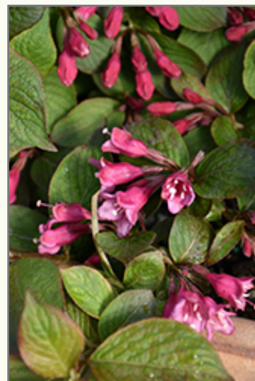
Midnight Sun Reblooming Weigela flowers