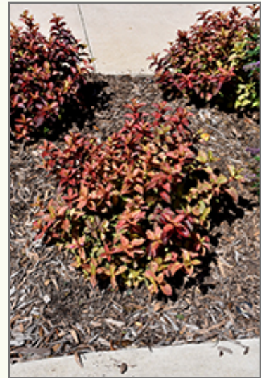
Midnight Sun Reblooming Weigela