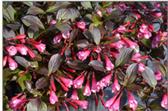
Very Fine Wine Weigela flowers

Very Fine Wine Weigela is recommended for the following landscape applications;