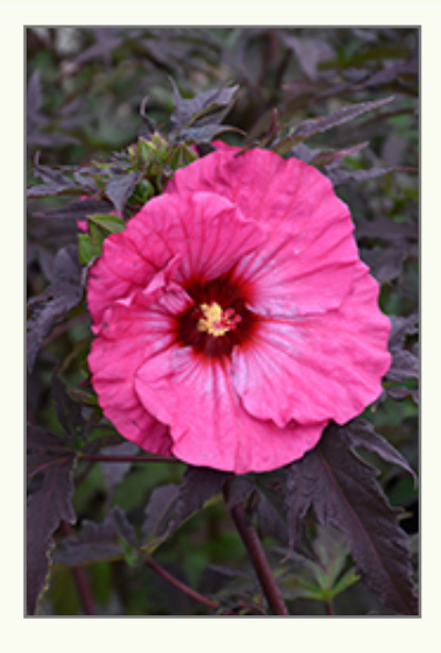
Inner Glow Hibiscus flowers

A beautiful mid to late season bloomer, featuring large, deep rose pink flowers with dark red eyes encircled by a light lavender halo; best performance in sunny gardens, borders and mass planting