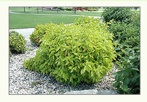
Prairie Fire Dogwood