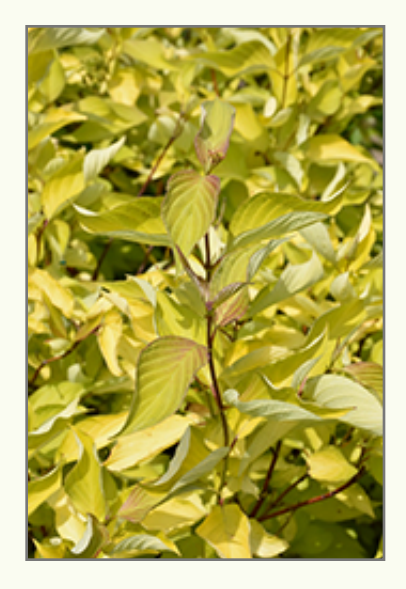
Prairie Fire Dogwood foliage