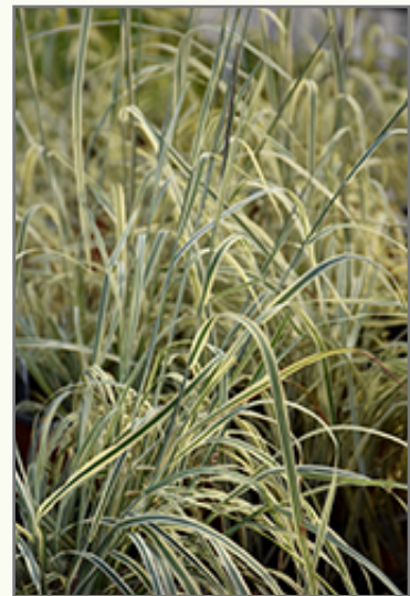
Shining Star Bluestem foliage

This is a relatively low maintenance plant, and is best cut back to the ground in late winter before active growth resumes. It has no significant negative characteristics.