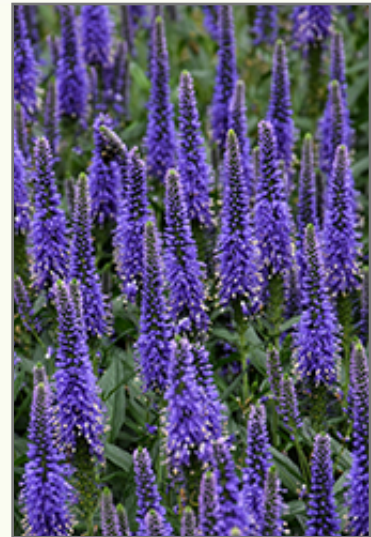
Skyward Blue Long-leaf Speedwell flowers

Skyward Blue Long-leaf Speedwell is recommended for the following landscape applications;