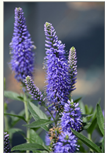
Skyward Blue Long-leaf Speedwell flowers