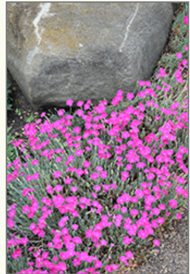
Firewitch Dianthus in bloom