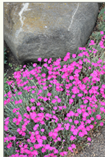
Firewitch Dianthus in bloom