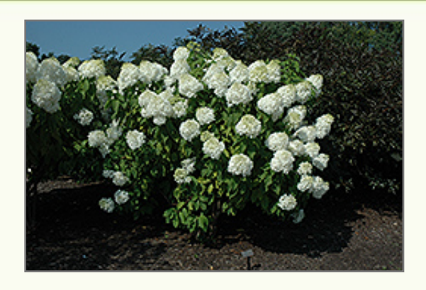
Phantom Hydrangea in bloom

Phantom Hydrangea is a multi-stemmed deciduous shrub with an upright spreading habit of growth. Its relatively coarse texture can be used to stand it apart from other landscape plants with finer foliage.