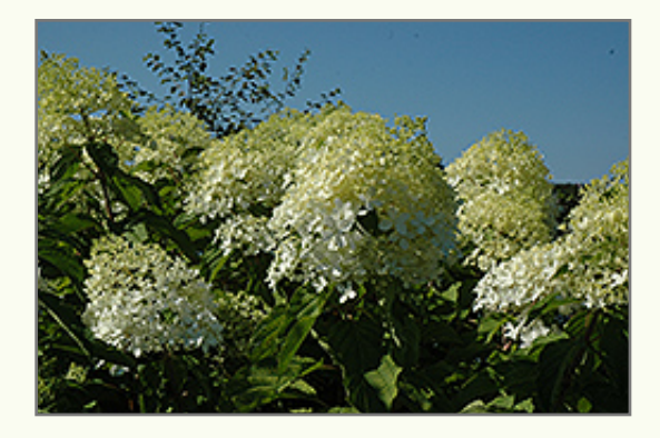
Phantom Hydrangea flowers

This is a high maintenance shrub that will require regular care and upkeep, and is best pruned in late winter once the threat of extreme cold has passed. It has no significant negative characteristics.