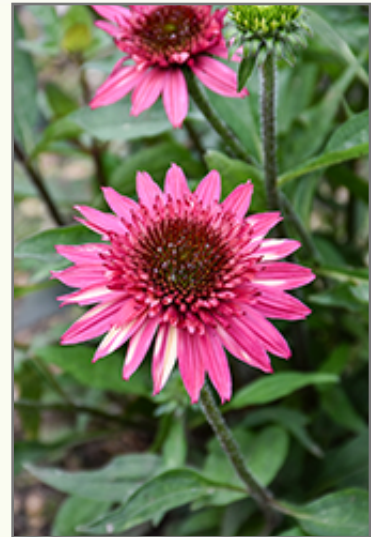
Giddy Pink Coneflower flowers

Giddy Pink Coneflower is recommended for the following landscape applications;