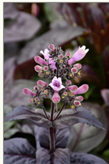
Dakota Burgundy Beard Tongue flowers

Dakota Burgundy Beard Tongue has masses of beautiful spikes of shell pink tubular flowers with lavender overtones, white throats and lavender streaks rising above the foliage from early to mid summer, which are most effective when planted in groupings. The flowers are excellent for cutting. Its attractive serrated pointy leaves emerge brick red in spring, turning burgundy in color with showy dark green variegation and tinges of crimson. As an added bonus, the foliage turns a gorgeous dark red in the fall. The dark red fruits with black overtones are held in abundance in spectacular clusters from late summer to early winter. The dark red stems are very colorful and add to the overall interest of the plant.