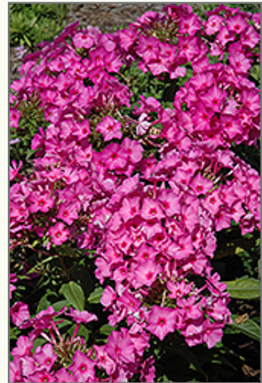
Flame® Pink Garden Phlox flowers