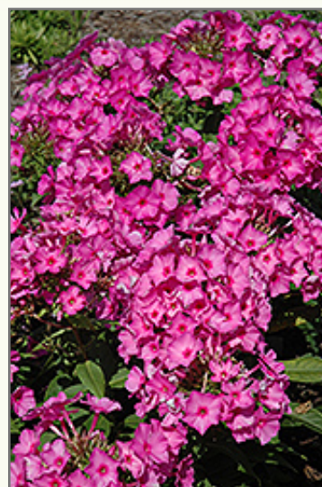
Pink Flame Garden Phlox flowers

This plant will require occasional maintenance and upkeep, and should be cut back in late fall in preparation for winter. It is a good choice for attracting butterflies and hummingbirds to your yard. Gardeners should be aware of the following characteristic(s) that may warrant special consideration;