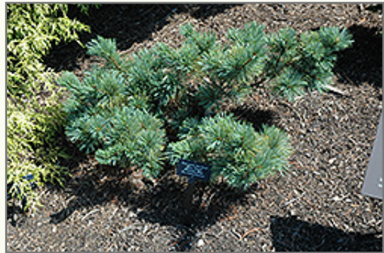
Blue Dwarf Japanese Stone Pine

This is a high maintenance shrub that will require regular care and upkeep. When pruning is necessary, it is recommended to only trim back the new growth of the current season, other than to remove any dieback. It has no significant negative characteristics.