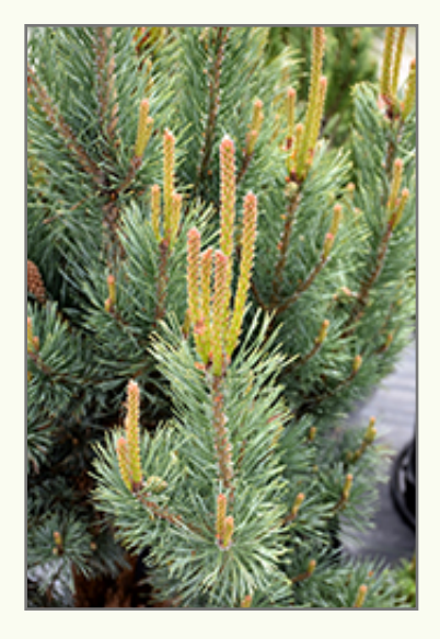
Dwarf Blue Scotch Pine foliage

This is a high maintenance shrub that will require regular care and upkeep. When pruning is necessary, it is recommended to only trim back the new growth of the current season, other than to remove any dieback. Deer don't particularly care for this plant and will usually leave it alone in favor of tastier treats. It has no significant negative characteristics.