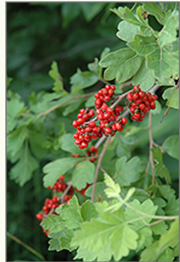
Fragrant Sumac fruit