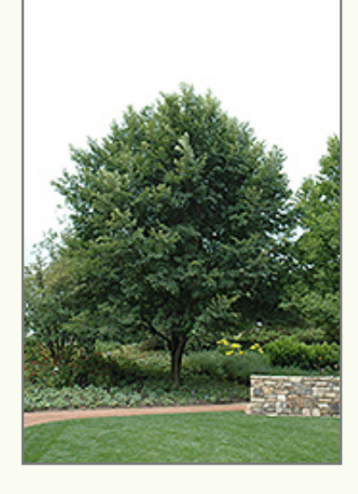
New Horizon Elm