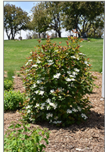
Redwing® American Cranberrybush in bloom