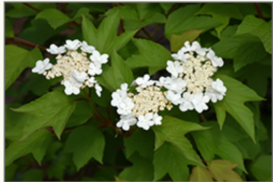
Redwing® American Cranberrybush flowers