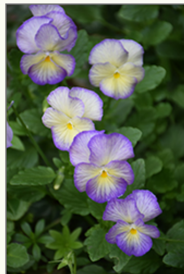
Etain Violet flowers