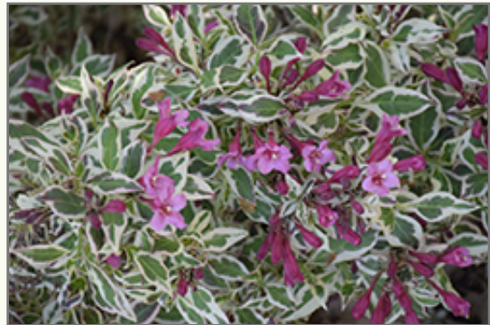
My Monet® Weigela flowers

My Monet® Weigela is recommended for the following landscape applications;