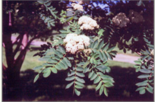
Showy Mountain Ash flowers