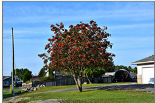
Showy Mountain Ash fruit

This tree will require occasional maintenance and upkeep, and is best pruned in late winter once the threat of extreme cold has passed. It is a good choice for attracting birds to your yard. It has no significant negative characteristics.