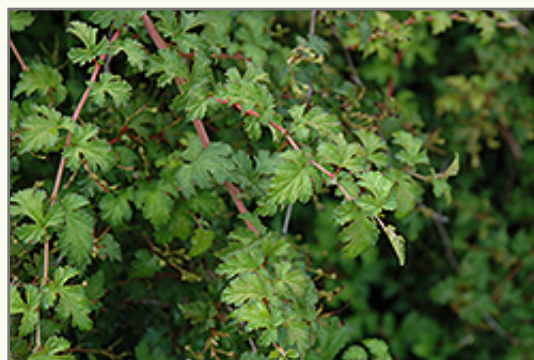
Crispa Cutleaf Stephanandra foliage