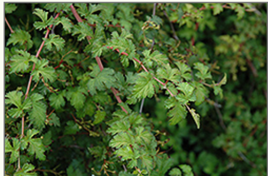
Crispa Cutleaf Stephanandra foliage