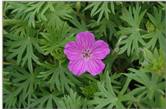
Tiny Monster Geranium flowers