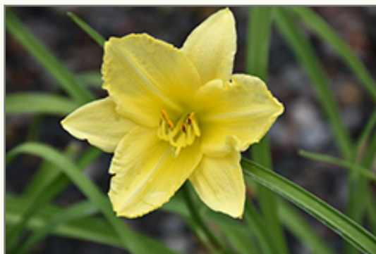
Big Time Happy Daylily flowers