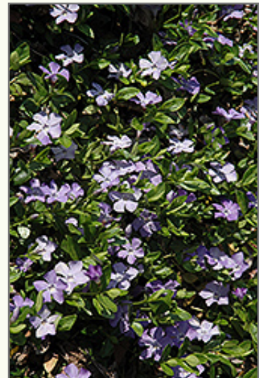
Periwinkle in bloom