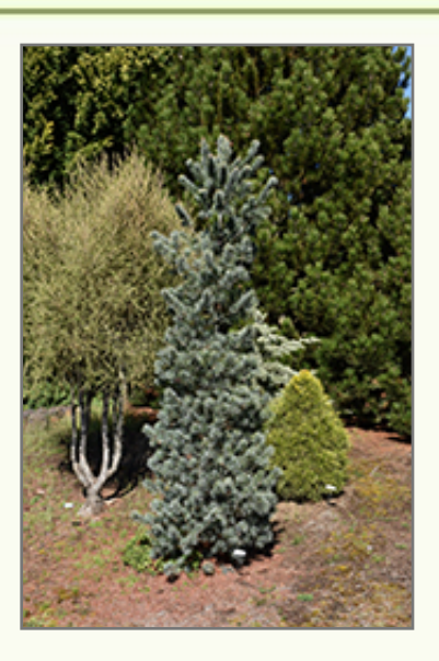
Blue Angel Japanese White Pine