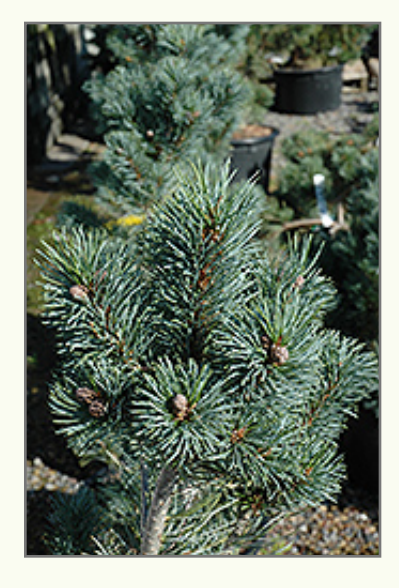
Blue Angel Japanese White Pine foliage