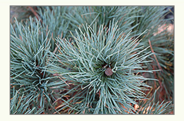
Dwarf Blue Swiss Stone Pine foliage