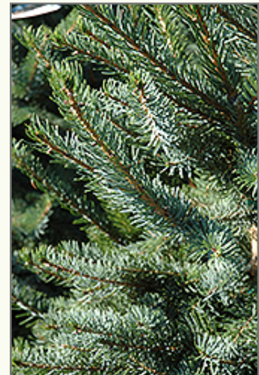
Brun's Serbian Spruce foliage