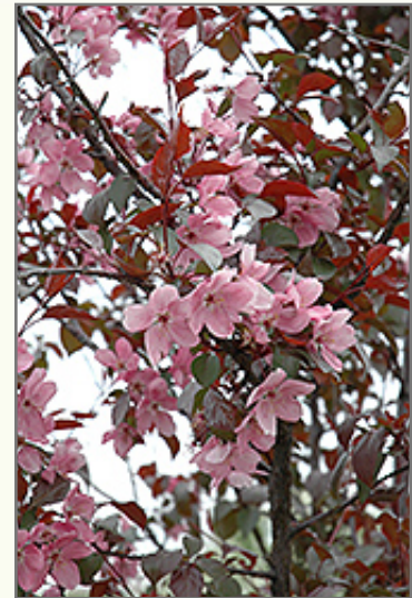
Perfect Purple Flowering Crab flowers

Perfect Purple Flowering Crab is recommended for the following landscape applications;