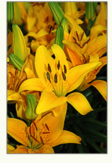
Tiny® Bee Asiatic Lily flowers

This variety is a compact lily that bears well formed, upward facing, bright yellow blooms; perfect for containers or massing along borders; they are also known to have multiple blooms per stem