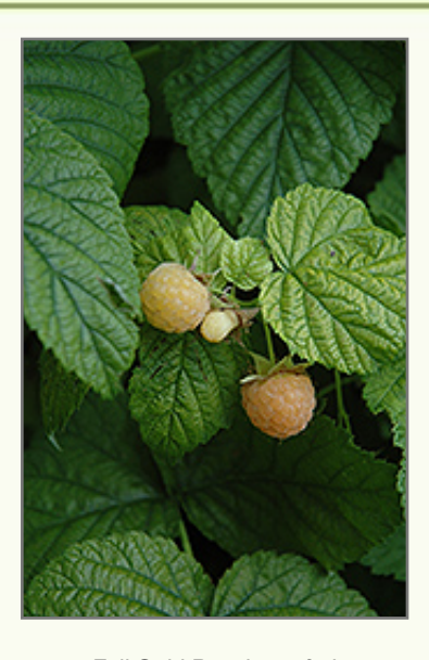
Fall Gold Raspberry fruit

Fall Gold Raspberry has rich green deciduous foliage on a plant with an upright spreading habit of growth. The fuzzy oval compound leaves do not develop any appreciable fall color. It features an abundance of magnificent gold berries with yellow overtones from mid summer to early fall.