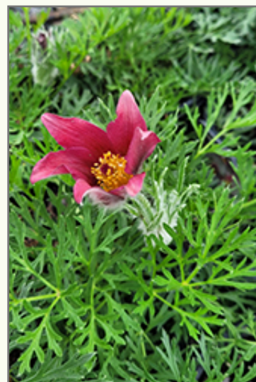
Red Pasque Flower flowers