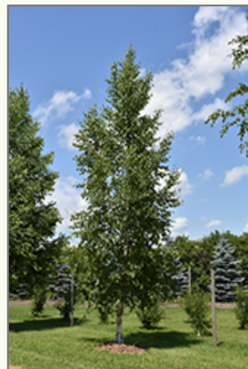
Prairie Dream® Paper Birch

This is a high maintenance tree that will require regular care and upkeep, and should only be pruned in summer after the leaves have fully developed, as it may 'bleed' sap if pruned in late winter or early spring. Deer don't particularly care for this plant and will usually leave it alone in favor of tastier treats. It has no significant negative characteristics.