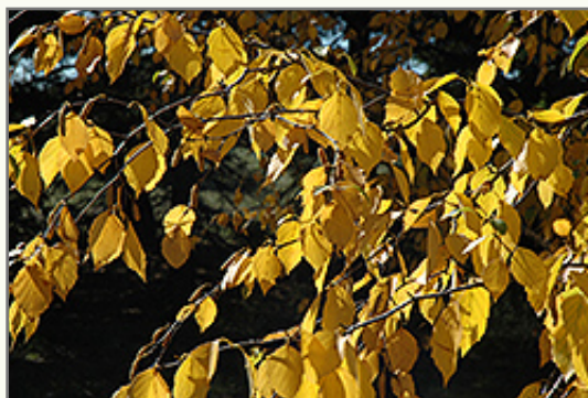
Prairie Dream® Paper Birch in fall