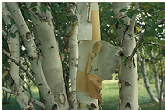
Prairie Dream® Paper Birch bark