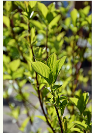
Red Twigged Dogwood foliage