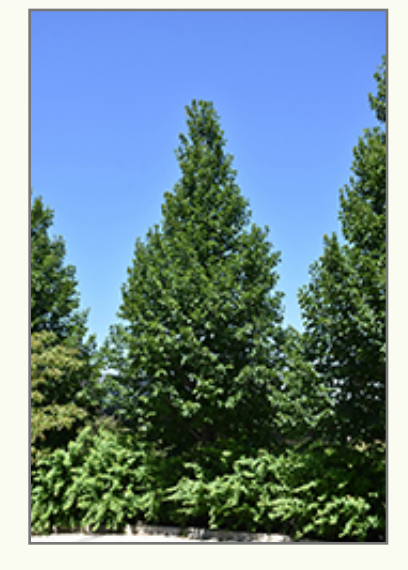
American Sentry® Linden