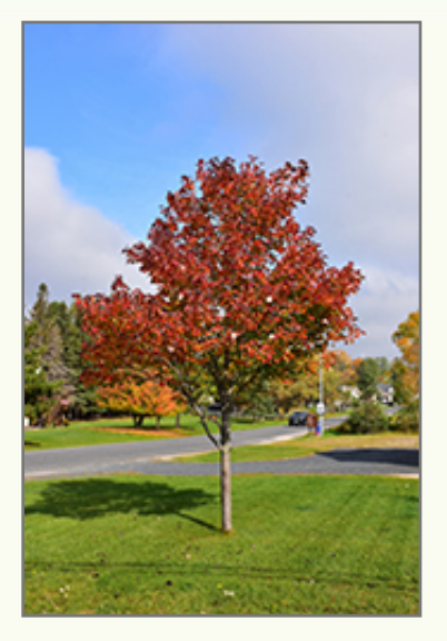
Northwood Red Maple in fall

Northwood Red Maple is recommended for the following landscape applications;