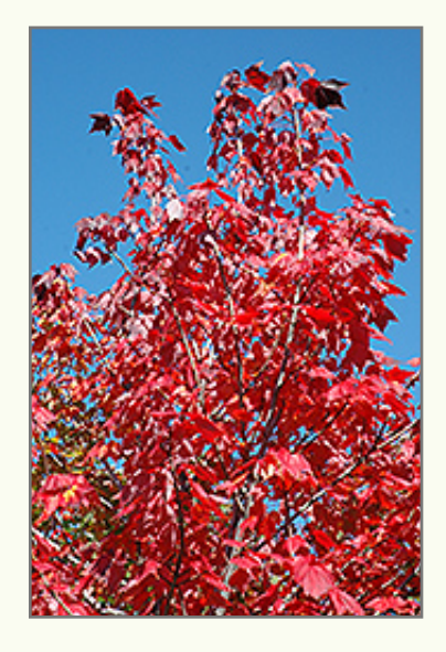
Northwood Red Maple in fall