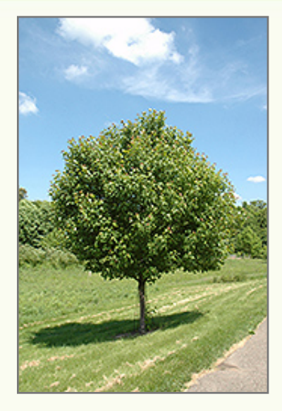
Northwood Red Maple