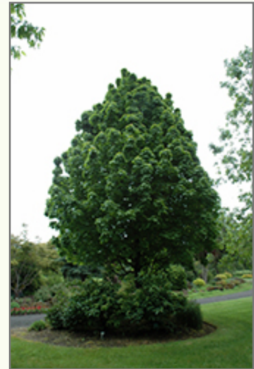
Apollo Sugar Maple

Apollo Sugar Maple is recommended for the following landscape applications;