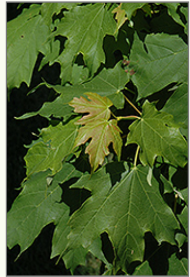
Apollo Sugar Maple foliage

#7 container $149.99 #15 container-$269 #20 container - $299. * Sizes and availability are subject to change. Please check with the store for specific details.