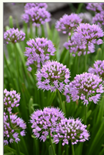
Summer Beauty Allium flowers