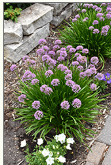
Summer Beauty Allium in bloom

Summer Beauty Allium is recommended for the following landscape applications;