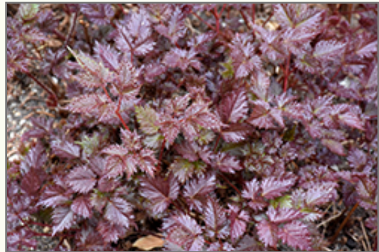
Delft Lace Astilbe foliage